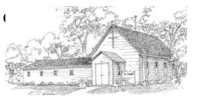
7 Oak Street, Greenwood Sunday Mass: 10:30 AM